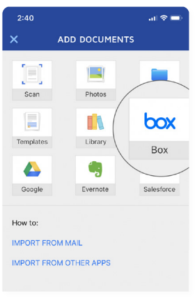
From Your Mobile Device: In the DocuSign app on iOS, Android and Windows 10, select a document from Box to sign or send for signature.