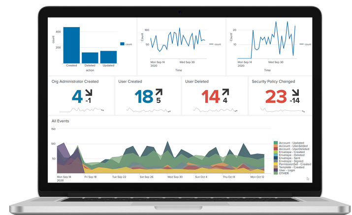
Monitor can integrate directly with your existing security stack (shown here in Splunk).